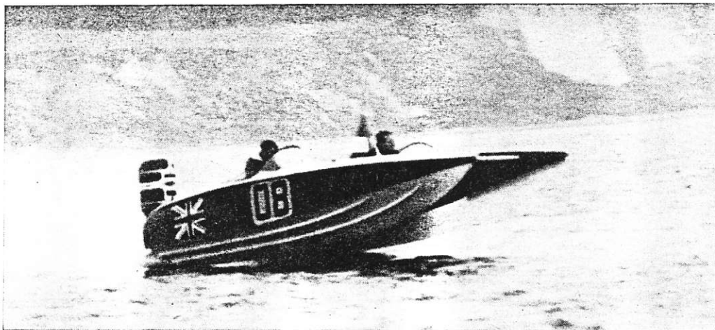
Tommy Sopwith's new 19ft. Walters/Wynne plywood catamaran—one of the most interesting new boats seen in offshore powerboat racing this season—but although she led the fleet home a mix-up at one of the marks brought disqualification.