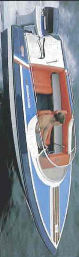
Bimini Outboard in Evinrude colours