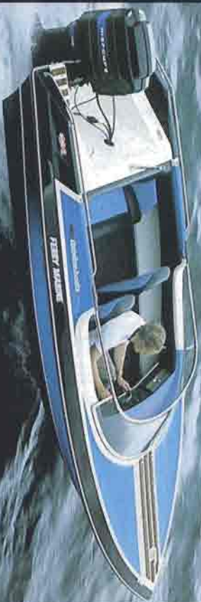
Bounny Outboard in Mercury colours