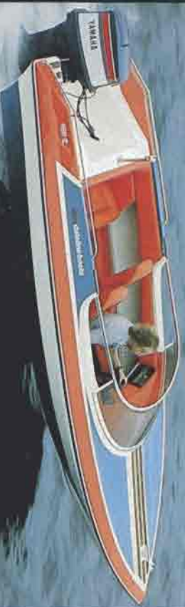
Bounny Outboard in Yamaha colours